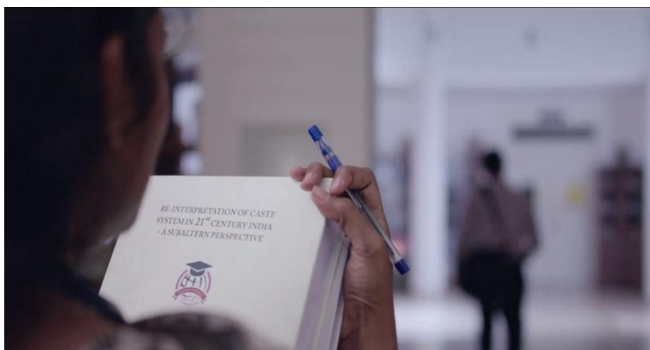
Pic 1 (The picture of Vidya who stood helplessly staring at her professor and her research thesis)

Apart from Sabha's issue, the writer is focused on another major issue rooted in society; caste. Caste is a deep-rooted one in our mind from the beginning onwards. The second part of the film depicts the misery faced by Vidya, a student who seems to be from a lower class, as a senior Professor belittles her and denies the completion of her Ph.D., citing her appearance as not worthy of an academic. He tells her that for her to know her worth, she should look at herself in the mirror citing her dark skin tone and further stating her role in society is to only sweep floors and clean garbage.