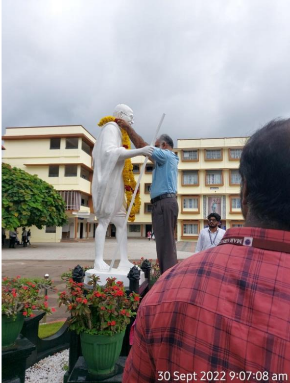
30 Sept 2022 9:07:08 am