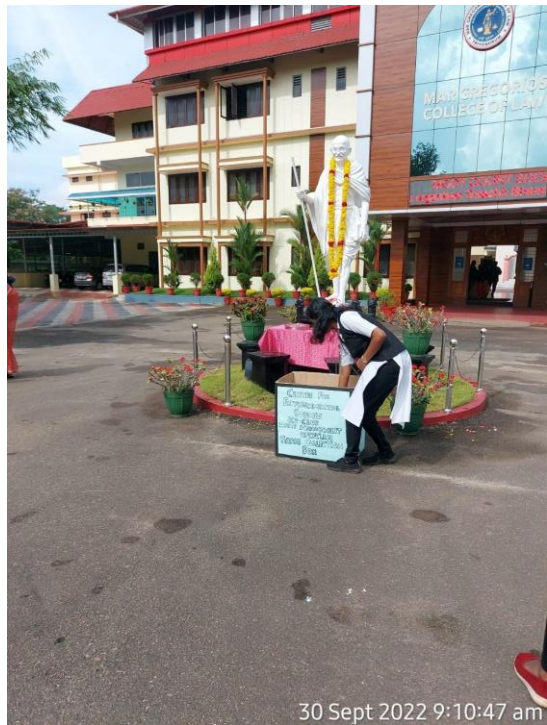
30 Sept 2022 9:10:47 am