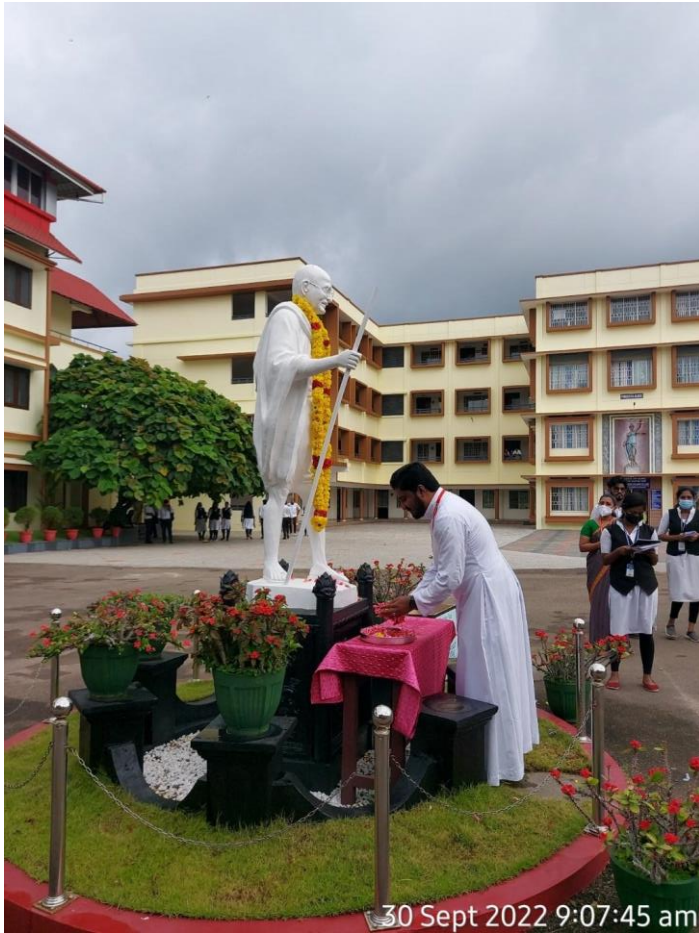
30 Sept 2022 9:07:45 am